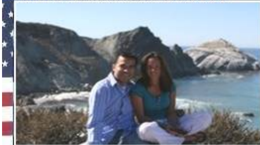
The Orchid Inn Hotel & San Simeon, CA